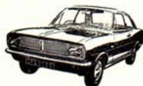
Front view "VAUXHALL VIVA" with Board on Roof.

Be taught to drive SAFELY and CORRECTLY by a Ministry Approved Instructor at