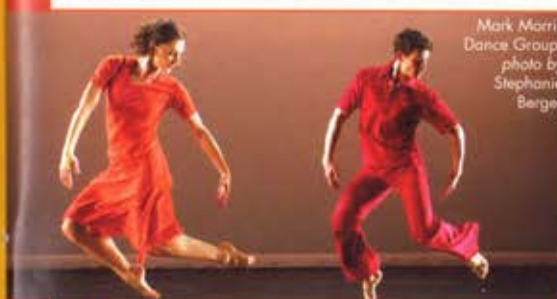
Mark Morris Dance Group