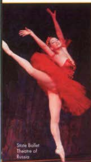
State Ballet Theatre of Russia