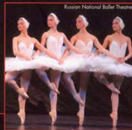
Russian National Ballet Theatre