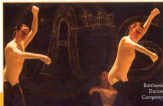
Batsheva Dance Company