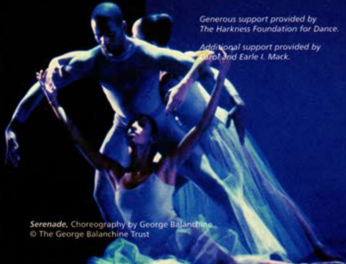
Serenade , Choreography by George Balanchine © The George Balanchine Trust