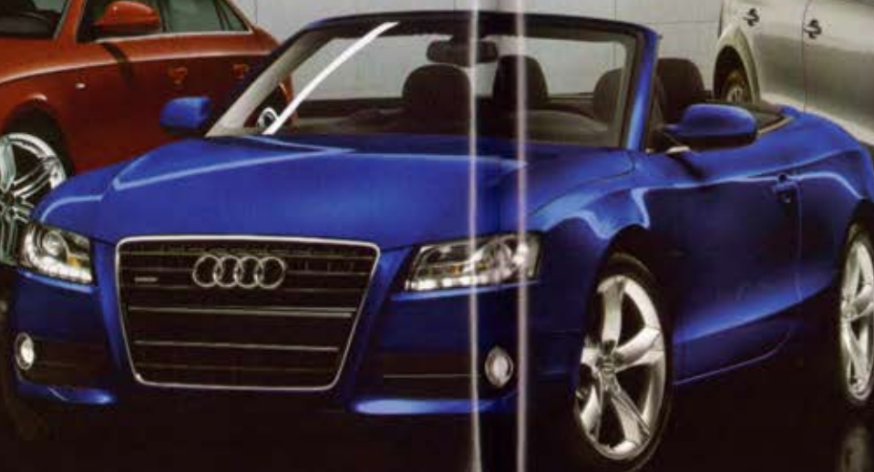
2010 Audi A5 2.0T Cabriolet Premium from $42,000