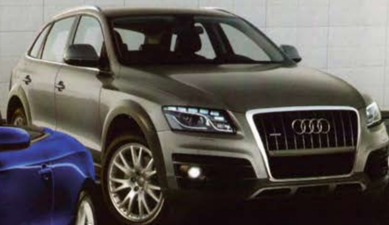
2010 Audi Q5 Premium from $37,350

There's never been a better time for the smart buyer to purchase the Audi they've always wanted. And there's never been a better place than THE COLLECTION.