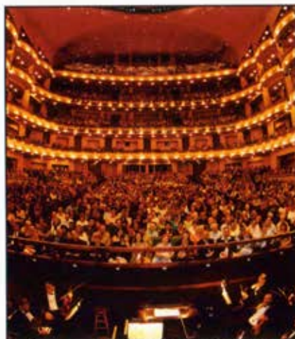
On the cover: Sanford and Dolores Ziff Ballet Opera House.