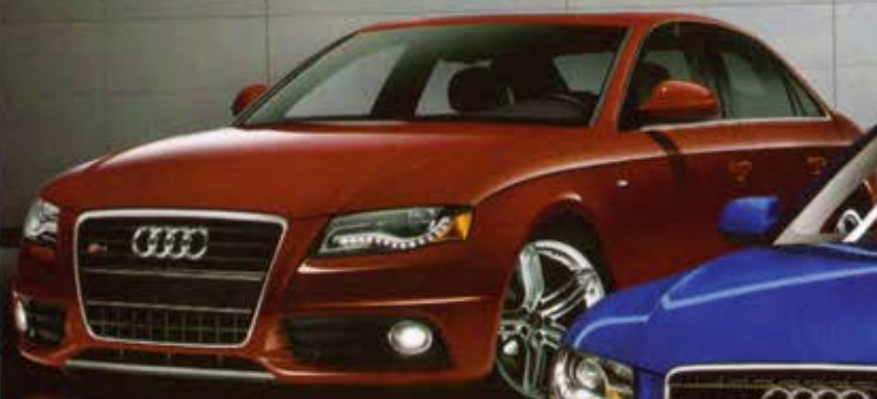
2010 Audi A4 2.0T Premium from $31,450

You've considered... You've researched... You've waited... Now is the time to head to THE COLLECTION.